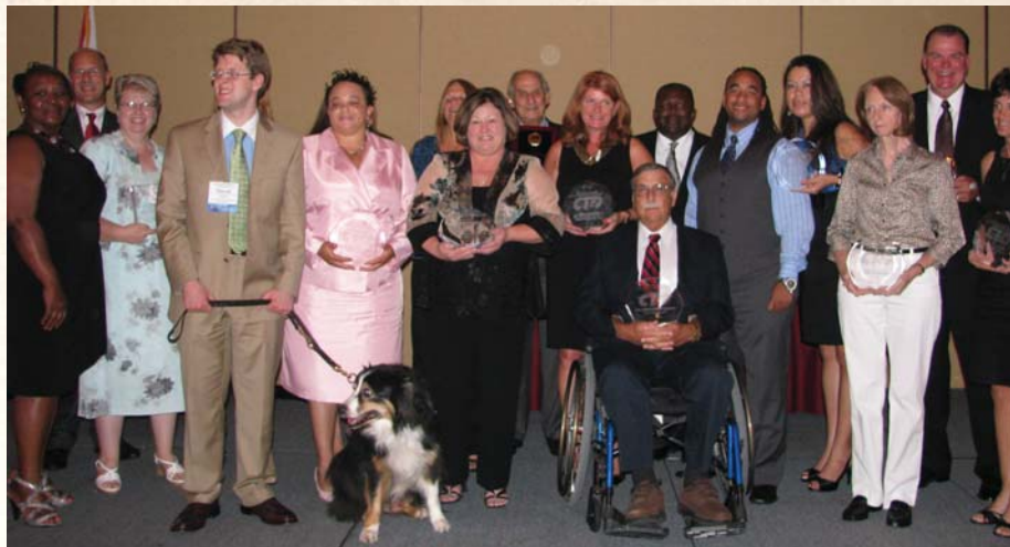
2011 TD Conference Award Recipients